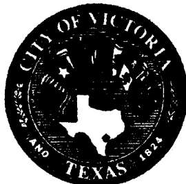
WILL ARMSTRONG, Mayor of the City of Victoria, Texas

APPROVED AND ADOPTED, this the 6th day of December , 2011.